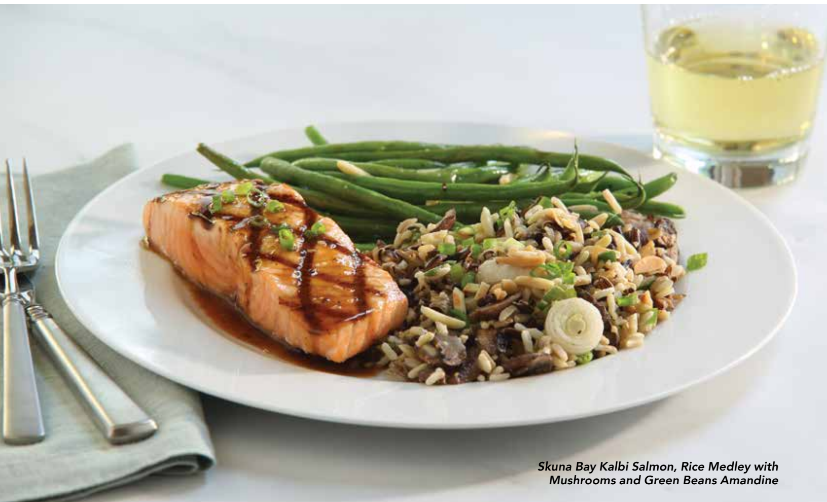
Skuna Bay Kalbi Salmon, Rice Medley with Mushrooms and Green Beans Amandine