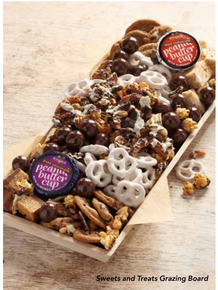
Sweets and Treats Grazing Board

Perfectly ripe strawberries dipped in chocolate. (24 pieces) $50