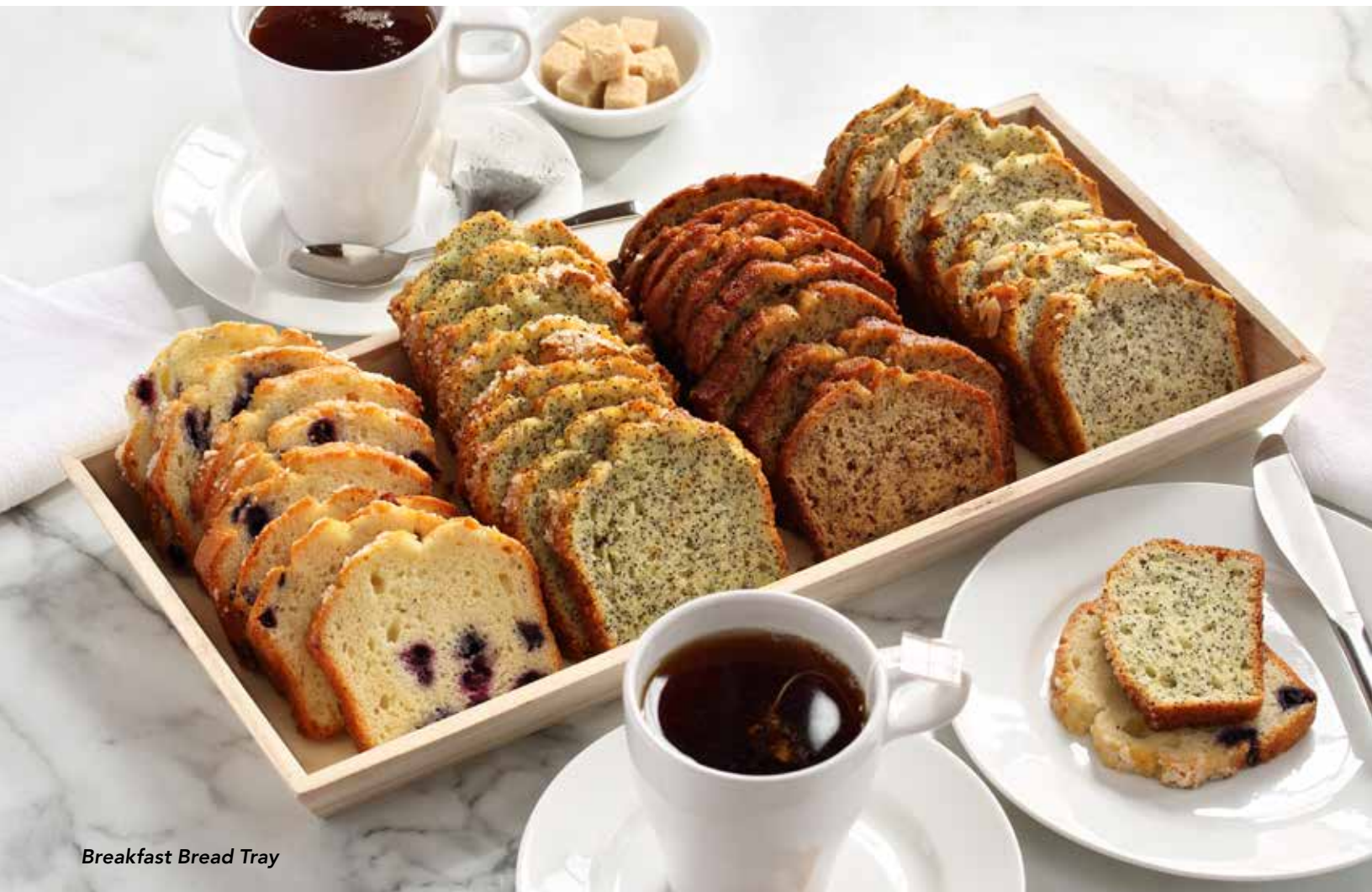
Breakfast Bread Tray