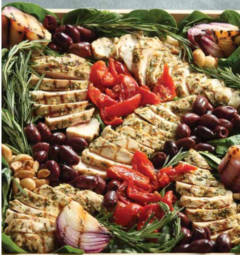
Rosemary Garlic Chicken Grazing Board

Three varieties of crackers are the perfect accompaniment for meat, seafood and cheese trays. (serves 25-30) $20