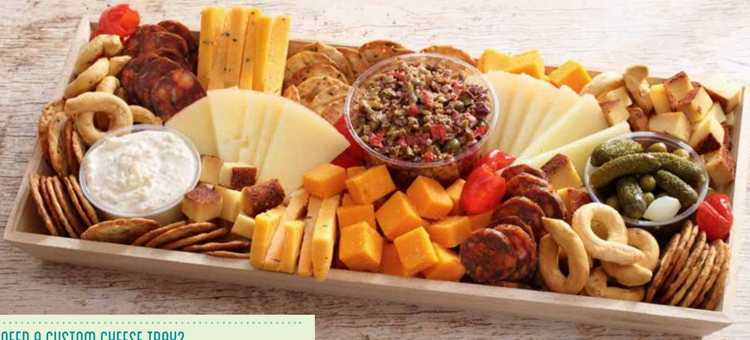
Quintessential Grazing Board

*Availability may vary by market and substitutions may apply.