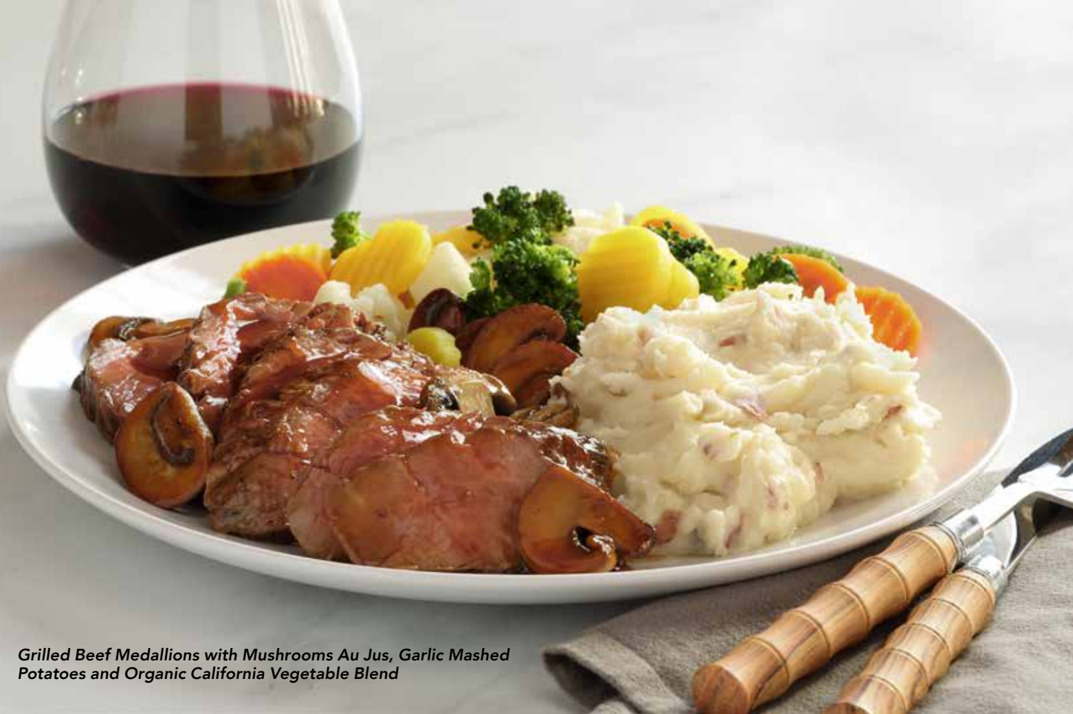
Grilled Beef Medallions with Mushrooms Au Jus, Garlic Mashed Potatoes and Organic California Vegetable Blend