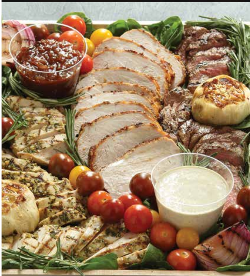
The Northwoods Grazing Board